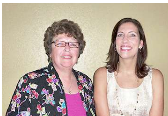
Co-Directors of PETT