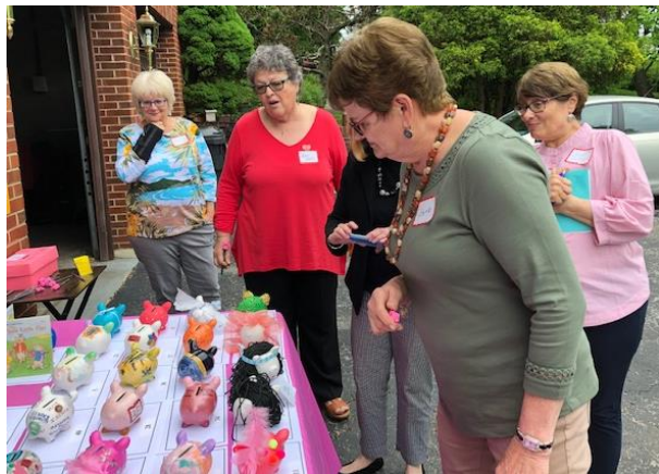
Contemplating the piggies in preparation for voting on most attractive.