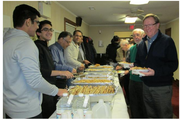
AAUW guests in the men's dinner line

women's dinner line, and served a dinner of basmati rice, chicken curry, naan, and other delicious dishes.