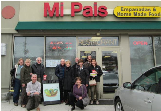
FIG Brunch Bunch