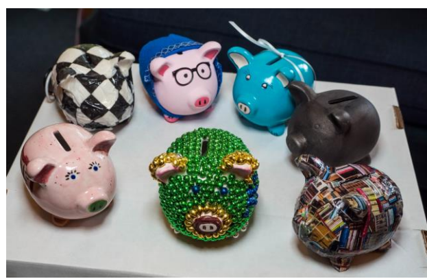
A few of those decorated Piggies.