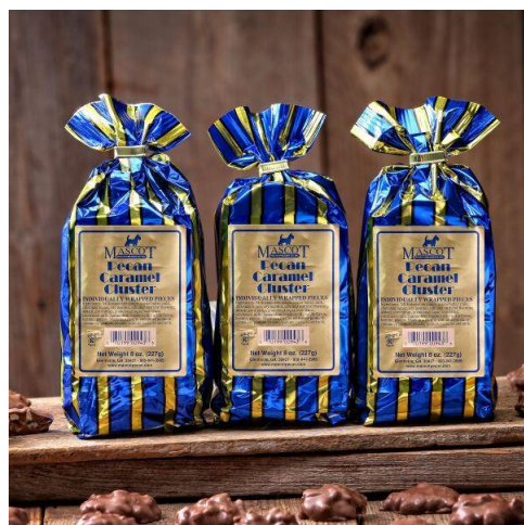
Pecan Caramel Clusters - $9.25 per 8 oz. bag