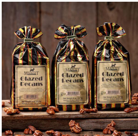
Glazed Pecans – $9.25 per 8 oz. bag