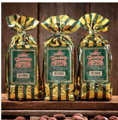
Chocolate Covered Pecans - $10.00 per 12 oz. bag