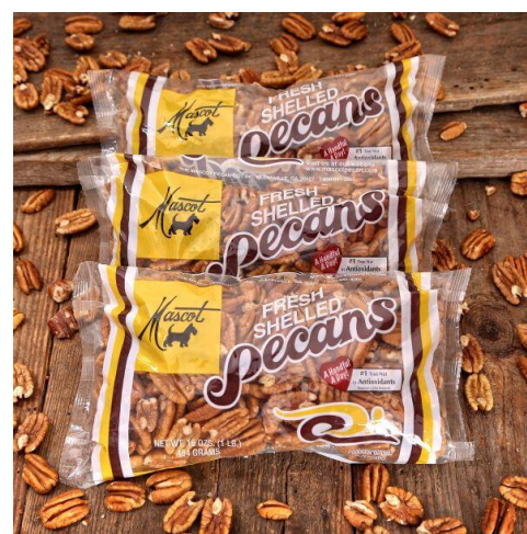
Extra Large Pecan Halves - $13.50 per 16 oz. bag