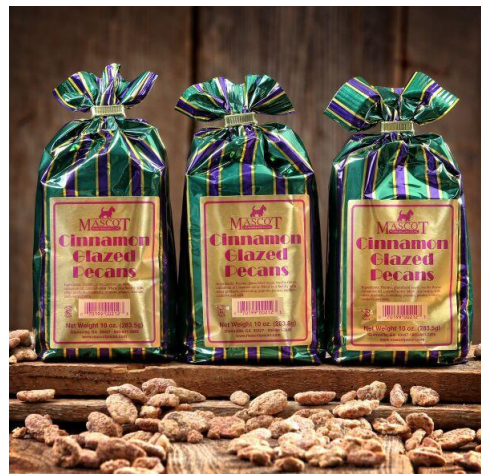
Cinnamon Glazed Pecans - $10.00 per 10 oz. bag