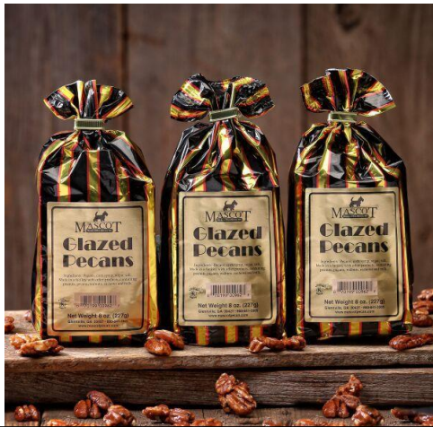
Glazed Pecans – $9.25 per 8 oz. bag