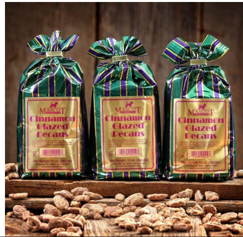
Cinnamon Glazed Pecans - $10.00 per 10 oz. bag