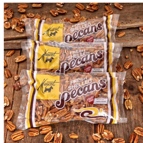
Extra Large Pecan Halves - $13.50 per 16 oz. bag