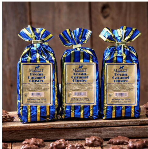
Pecan Caramel Clusters - $9.25 per 8 oz. bag