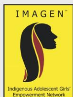
IMAGEN supports Native American girls by providing tools to establish sacred matrilineal neighborhood spaces for “Girl Societies.”

Knowledge is shared between generations. Girls receive weekly support with topics sovereignly chosen by each Society including: