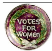
Votes for Women – worn by women to identify themselves as a suffragette (colors – purple, green, white)

Above: Mills used her art for political purposes, to support the suffragettes and express outrage at how they were treated.