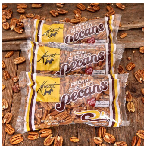
Extra Large Pecan Halves - $13.50 per 16 oz. bag