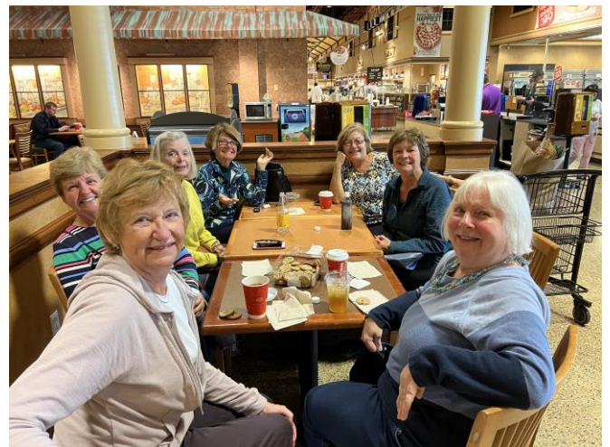
November Meet up at Wegmans Cafe

specific Special Interest group. You buy your favorite beverage and we'll purchase a bakery item ☺. Please contact Kim Glavin 484 354-9681 if you have any questions.